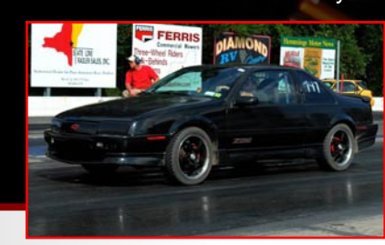
1995 Chevrolet Beretta Z26 Front Wheel Drive V6 / Automatic

As with any daily driver, most of your time is spent inside, and the eighties-style maroon interior was intolerable to my taste. The whole interior was modified to fit the style of the rest of the car. Everything